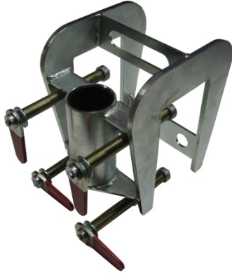
30036 Barrel Mount Base EN795 (Piling sheets etc.)