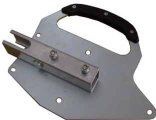
60176 Rigga to Davit Bracket for Rigga 15R (Recovery Block)